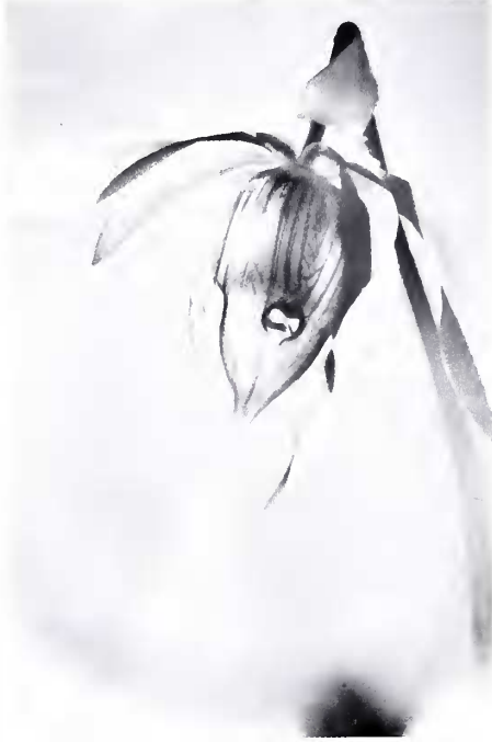
Darlingtonia pitcher (L) and flower (R).